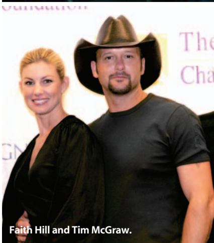
Faith Hill and Tim McGraw.