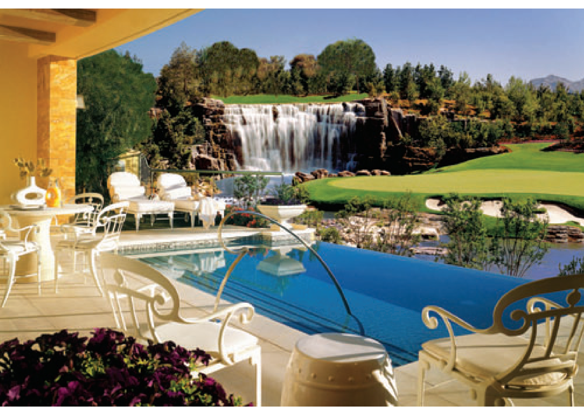
Clockwise from above: A vanishing-edge plunge pool on the veranda overlooks the 18th fairway of the Wynn Golf and Country Club, with Sunrise Mountain in the background; whimsical touches like coiled-glass sculptures set off the suite's informal luxury; his-and-hers bathrooms feature galuchat wall treatments and chromatherapy lighting.