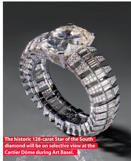
The historic 128-carat Star of the South diamond will be on selective view at the Cartier Dôme during Art Basel.

While the Cartier Dôme will be open to the public every day from 2 to 4 p.m. during Art Basel, it will also be open for VIP guests by appointment and host a series of private events in honor of art-world personalities, including the opening-night dinner co-