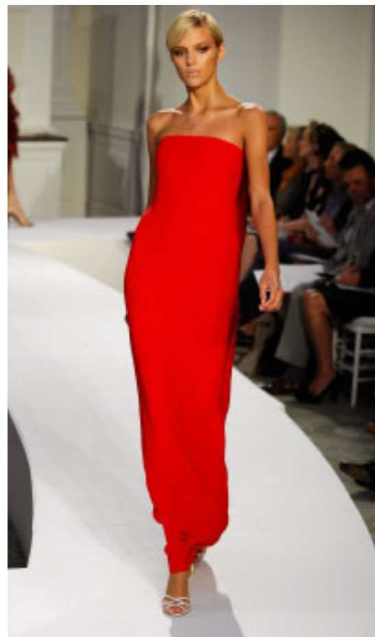
From left: With Audrey Hepburn at an event honoring designer Hubert de Givenchy, 1988; a model walking the runway in a gown from Oscar de la Renta's spring 2008 collection during Mercedes-Benz Fashion Week.