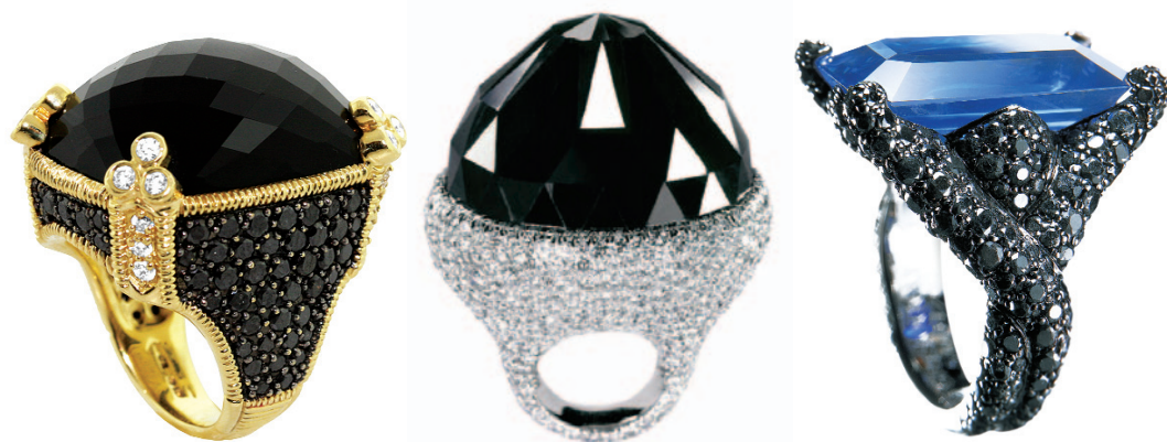
From left: Black Monaco ring set in 18K yellow gold with a faceted onyx surrounded by 4.37 carats of black diamonds by Judith Ripka, available at Judith Ripka, Bal Harbour; the Spirit of de Grisogono ring, with the world's largest cut black diamond, by de Grisogono, available at East Coast Jewelry, Sunny Isles Beach; ring in white gold with 4.80 carats of black diamonds and an emerald-cut blue sapphire of 14.67 carats by de Grisogono, available at East Coast Jewelry, Sunny Isles Beach.

in the business at luxury houses such as Bulgari and Harry Winston before designing the iconic Ice Cube collection for Chopard, is widely credited with initiating the current trend in black-diamond jewelry