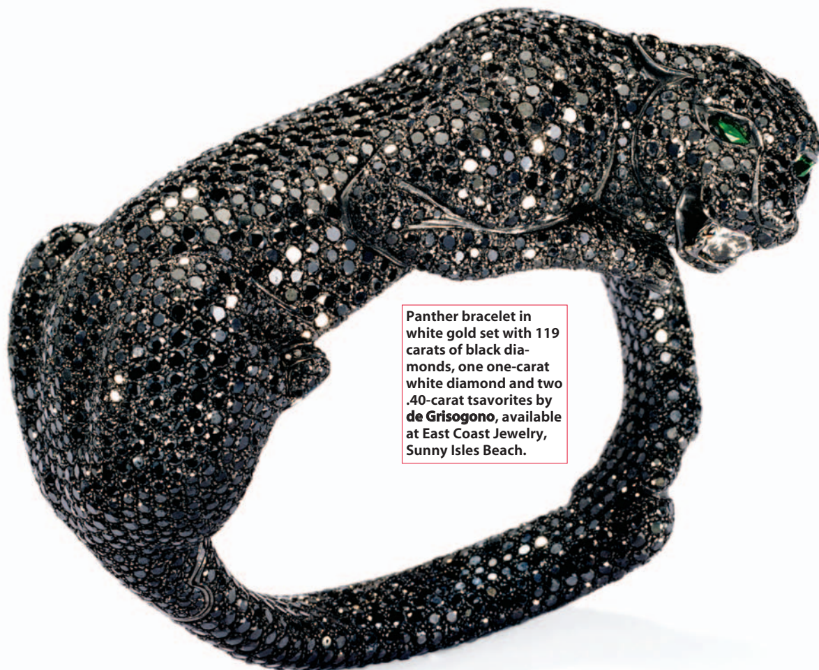
Panther bracelet in white gold set with 119 carats of black diamonds, one one-carat white diamond and two .40-carat tsavorites by de Grisogono, available at East Coast Jewelry, Sunny Isles Beach.